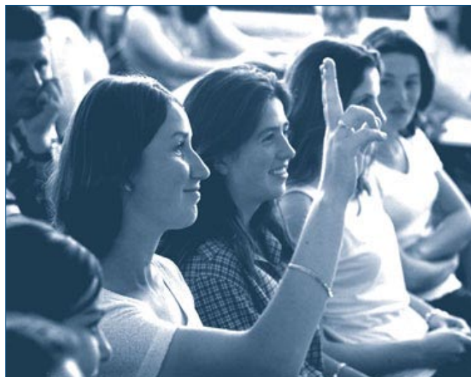
Raising awareness about democratic principles, the Mission offers its expertise and financial support to a Supplementary Democratic Education Programme for nine-grade students across Kosovo.

■ Media Development - Contributing to the formation of a diverse and self-sustainable media sector in Kosovo and to the creation of conditions that support freedom of the media and freedom of information are main goals of the OSCE. Efforts are undertaken to establish guidelines and recommendations for the media on how to co-operate with law enforcement agencies and how to conduct training on media legislation. Moreover, the OSCE has been instrumental in the current process of establishing the Independent Media Commission (IMC).