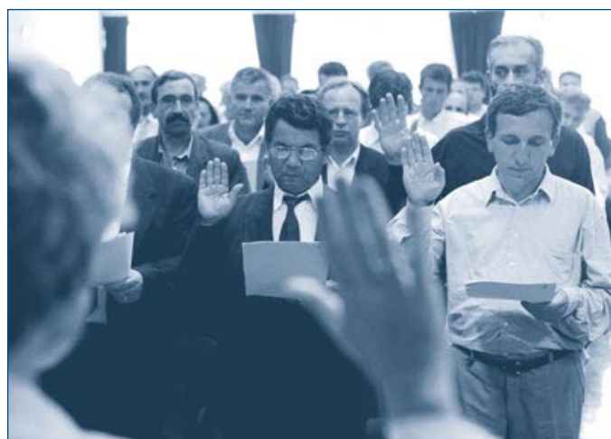
Promoting rule of law, the Mission helps train judges, prosecutors, legal professionals, and law enforcement officials.